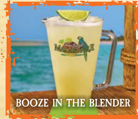
BOOZE IN THE BLENDER

Margaritaville Silver Tequila, Blue Curaçao and our house margarita blend. Served on the rocks (280 calories)