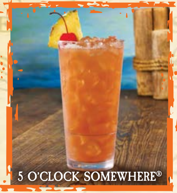
5 O'CLOCK SOMEWHERE®

Myers's® Original Dark Rum blended with blackberry and banana purées and topped with Cruzan® Hurricane Proof Rum. Served frozen (310 calories)